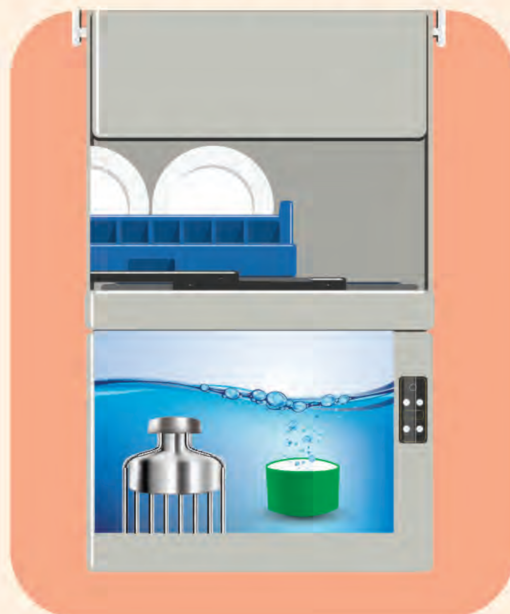
Unit placed in dishwasher basin